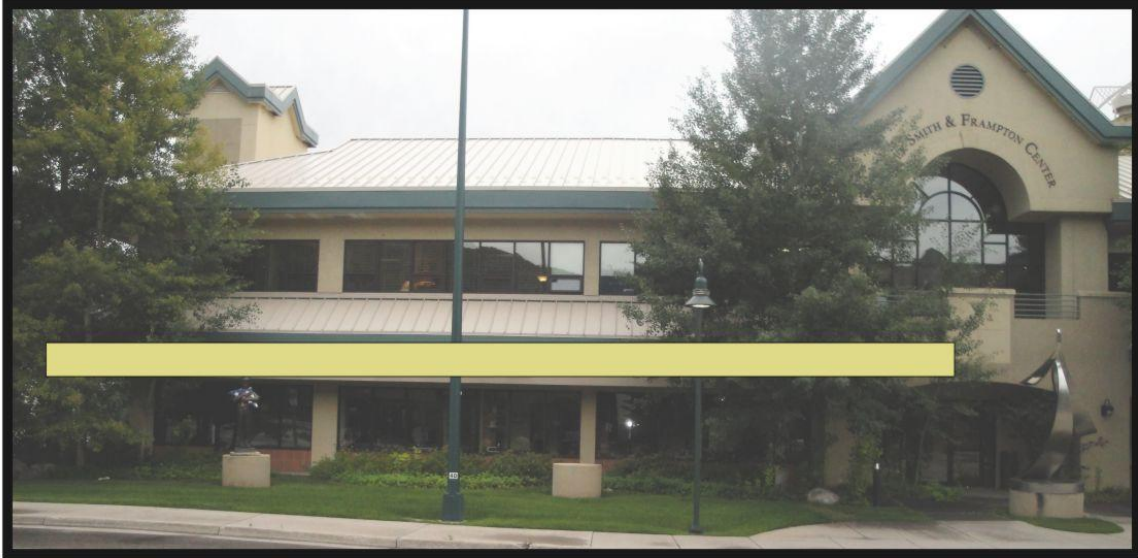
EXHIBIT 1, First Floor North Side East