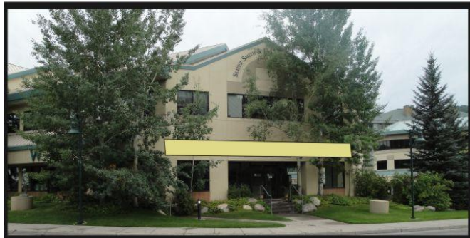
EXHIBIT 1, North Side West