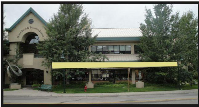
EXHIBIT 1, North Side Center