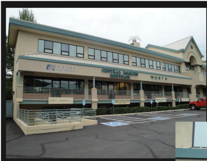
EXHIBIT 6, Temporary Banner