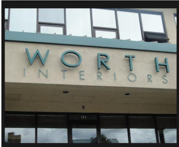
EXHIBIT 3, Combination Reverse Pan Chanel and Cut Out Letters

Sign DESIGN & Graphics, LLC TEL: (970) 949-4565 FAX: (970) 949-4670