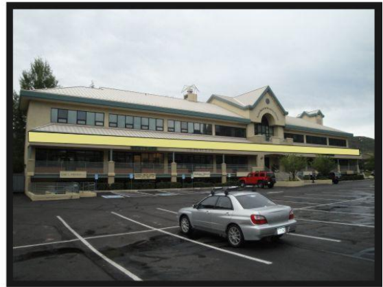
EXHIBIT 2, First Floor South Side