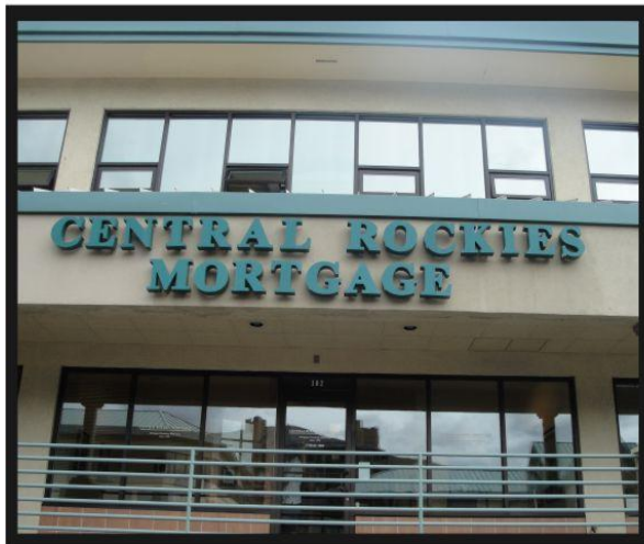
EXHIBIT 3, Pan Chanel Letters