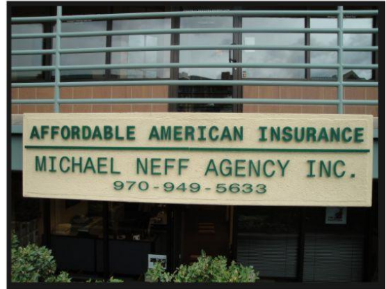
EXHIBIT 5, Garden Example

Sign DESIGN & Graphics .llc TEL: (970) 949-4565 FAX: (970) 949-4670