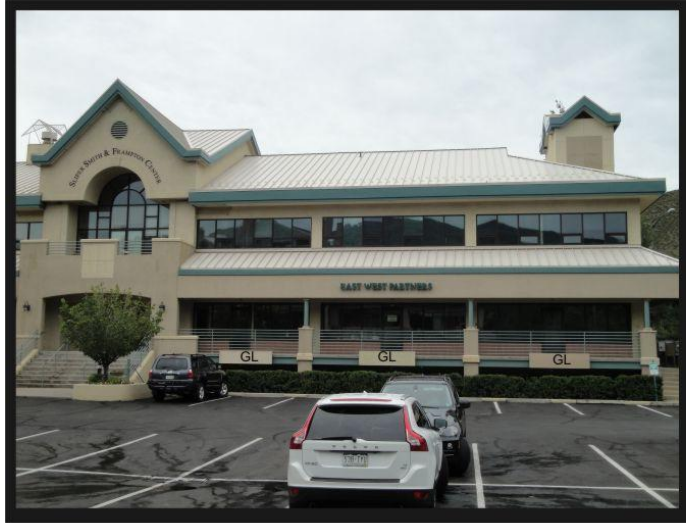
EXHIBIT 5, Garden Level East

Sign DESIGN & Graphics .llc TEL: (970) 949-4565 FAX: (970) 949-4670